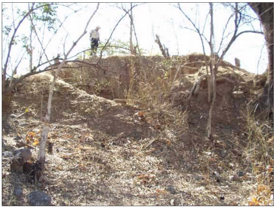
PUNIAN SITE . This Late Classic center has been the target of looters for many years. The main pyramid, which appears in this view, was trenched and cored.