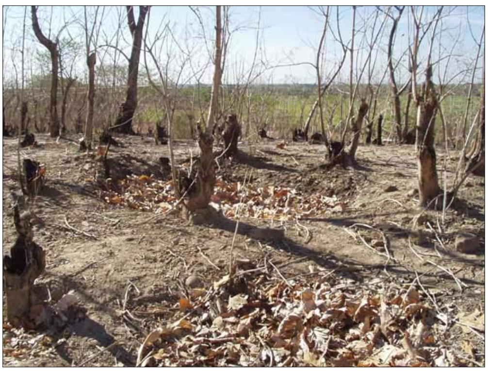
PUNIAN SITE. Huge looters pits pockmark an artificial terrace.