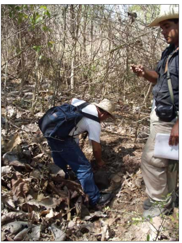
LAS MARIAS SITE. A looters pit on a terrace in an area concealed by scrub.