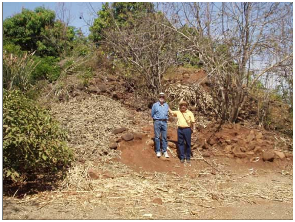
CERRO DE ULATA SITE . The main pyramid at this site was trenched by looters. The two individuals in this photograph stand on the tailings of this trench, which extends directly behind them.