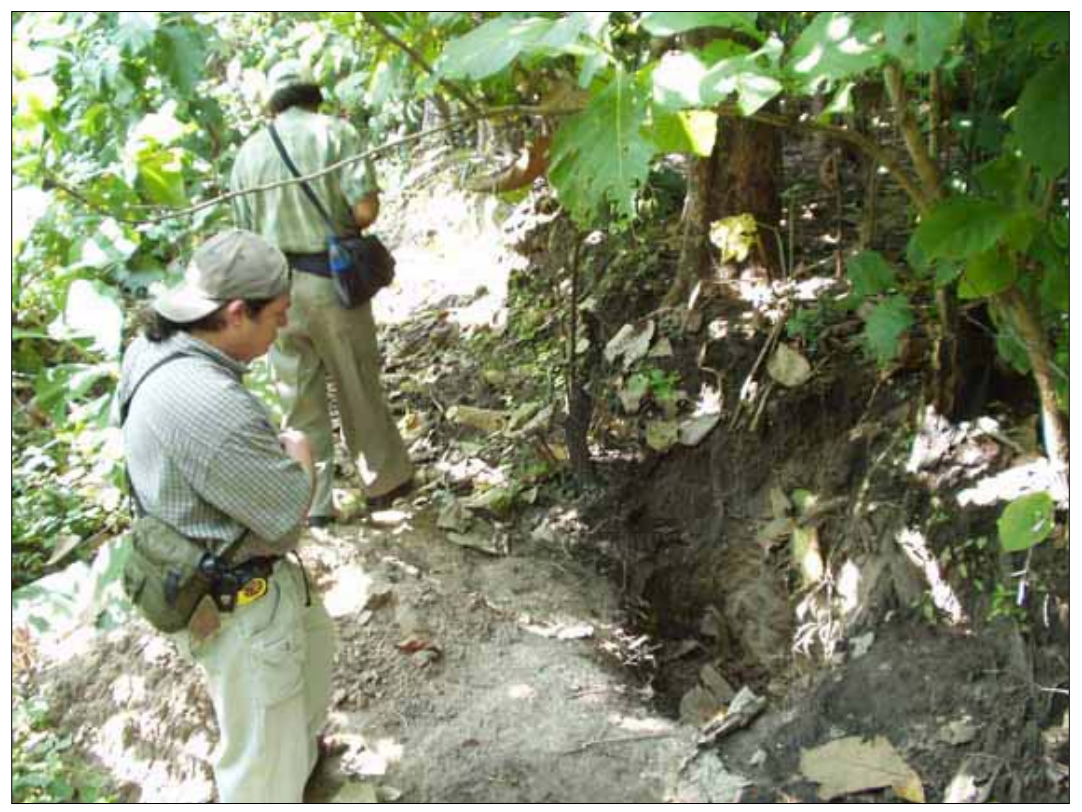
PUNIAN SITE. A fresh looters pit is noted by government archaeologists.