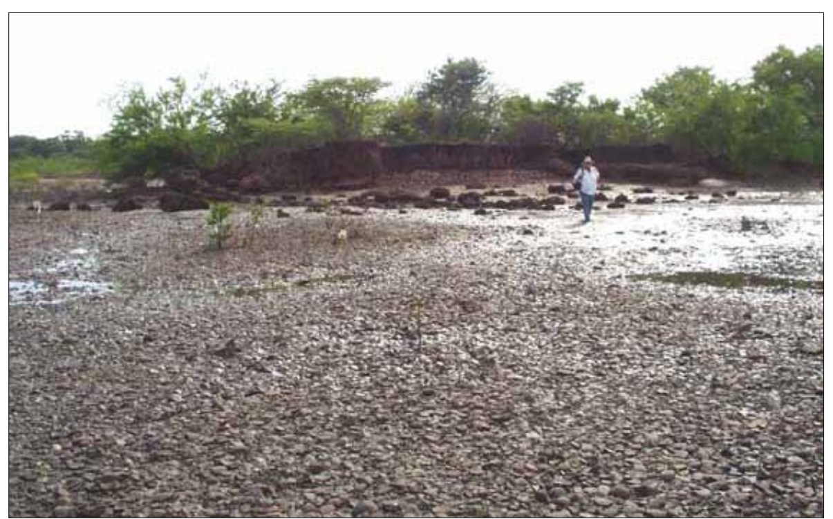
LAS TUNAS SITE. This coastal mound was a salt production center in the Preclassic period. The sea has eroded most of the mound, created a literal beach of sherds. Local residents sell the more complete objects and have even sold human skulls from burials.