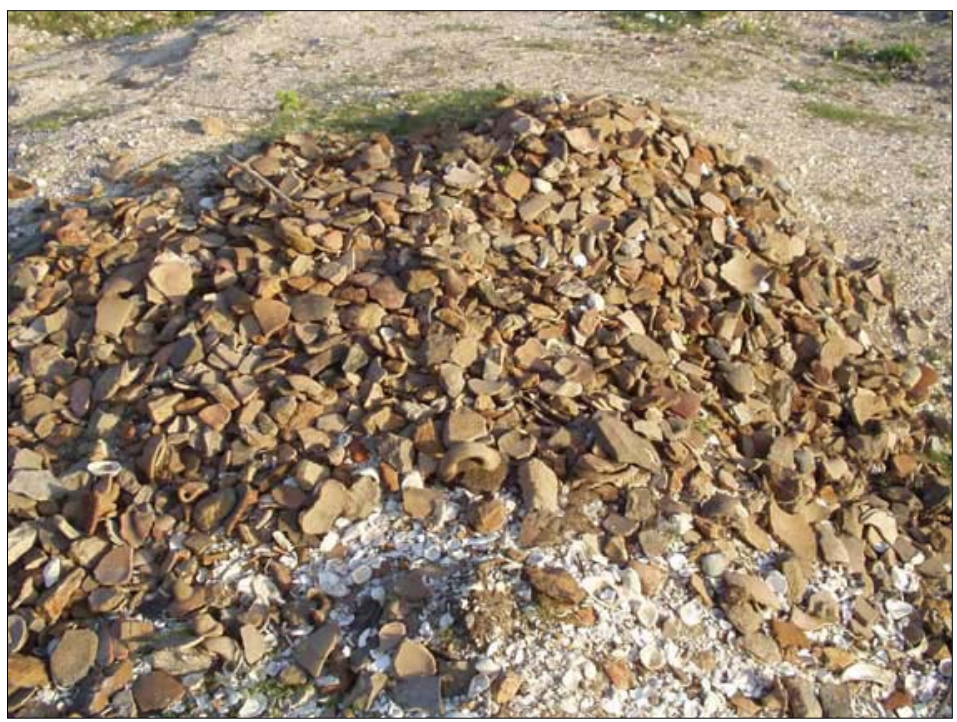
CHAPERNALITO SITE (also known as "Asayamba"). Non-saleable ceramics are tossed on a heap.

The following is a selection of photographs of recent depredation taken at several archaeological sites in El Salvador.