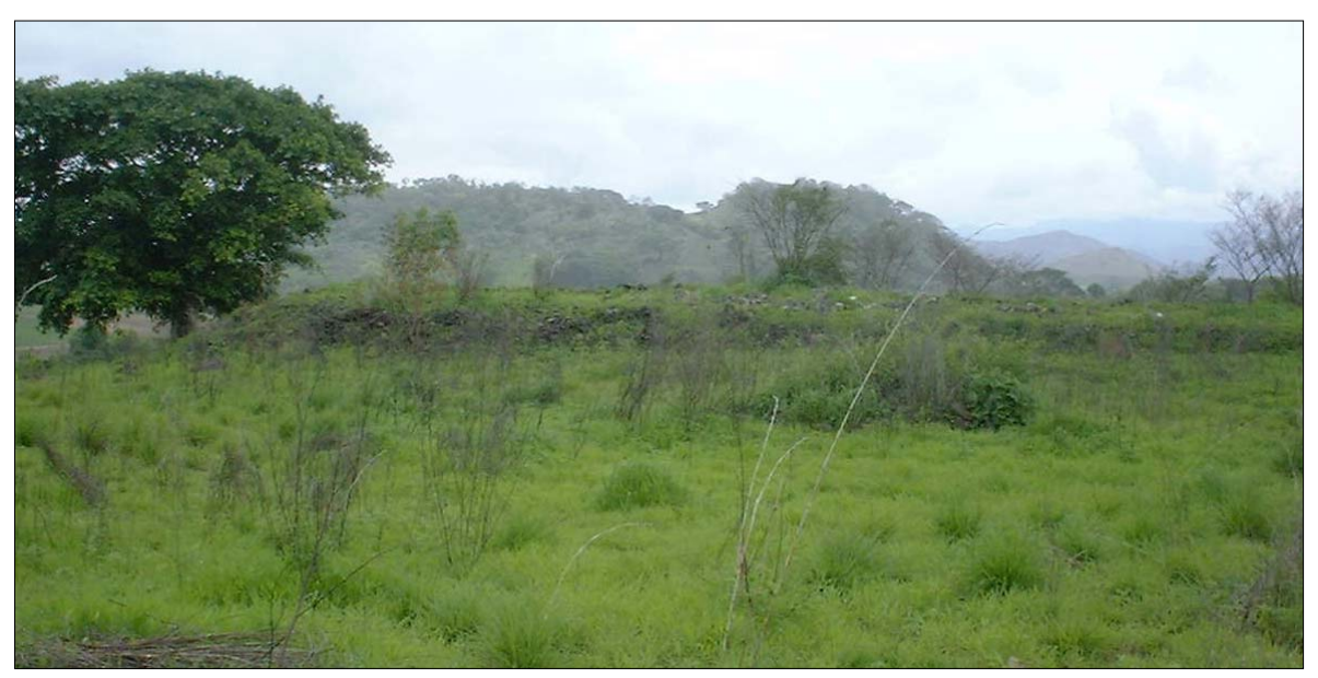
AZACUALPA SITE . Looters have recently targeted the 80 meter long range structure at this Early Postclassic site. In this view, the structure extends beyond the right edge of the photo.