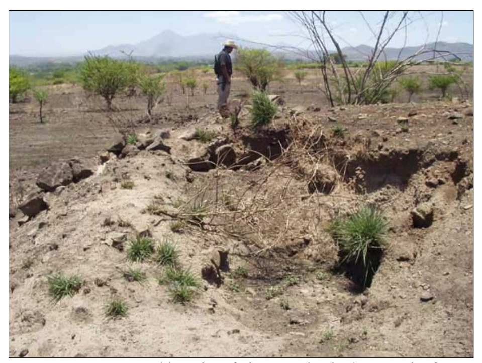
CIHUATAN SITE . This series of pits were dug in the summit of a pyramid under the cover of tall scrub and were revealed after a fire.