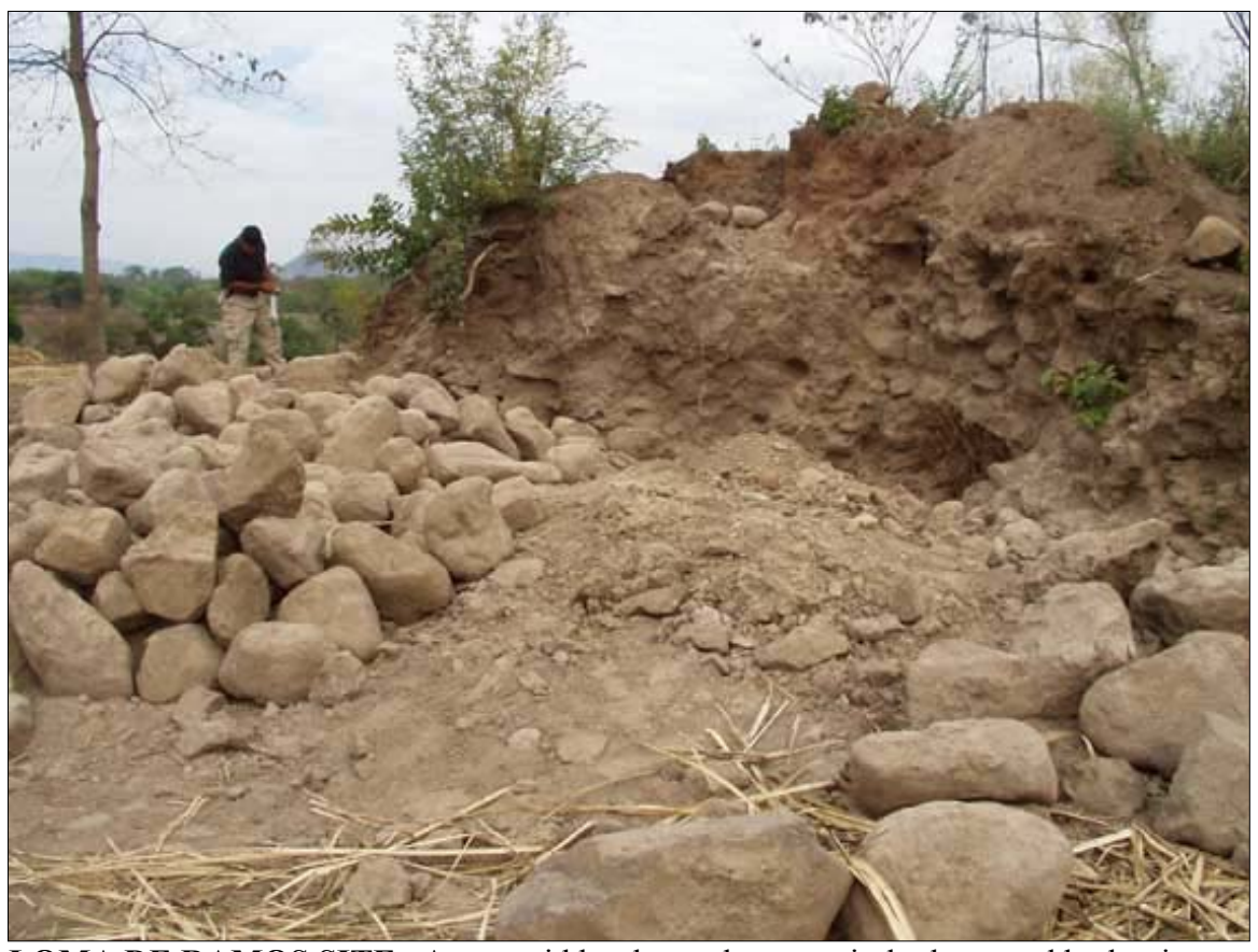
LOMA DE RAMOS SITE. A pyramid has been almost entirely destroyed by looting.