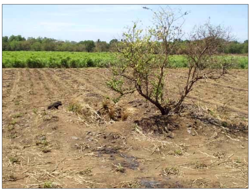
EL MONO SITE. Views of two mounds gutted by looters.