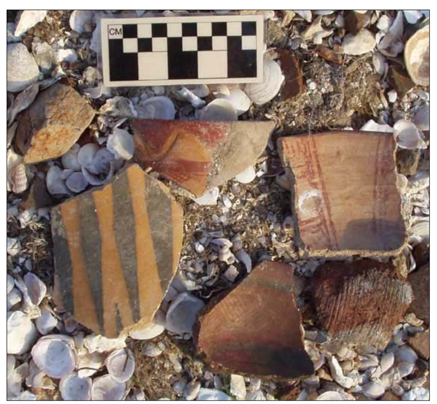
CHAPERNALITO SITE (also known as "Asayamba"). Detail of some of the Late Classic ceramics left in a heap.