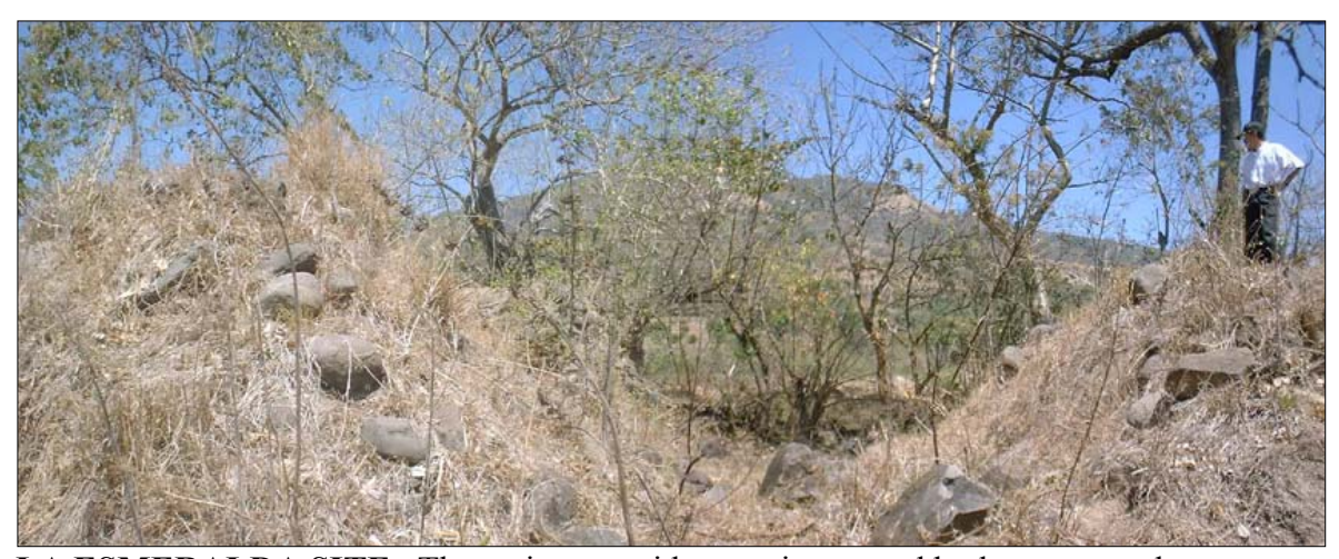
LA ESMERALDA SITE. The main pyramid was crisscrossed by looters trenches.