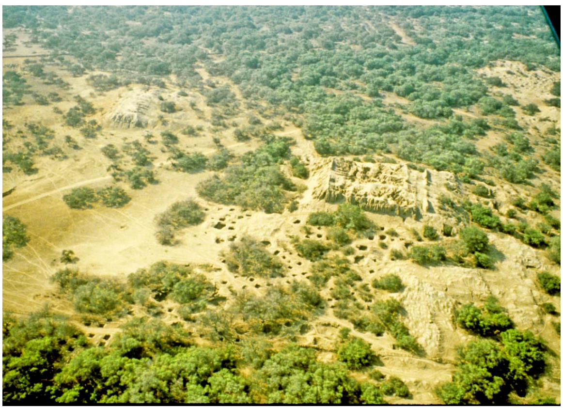
2. Huaca Las Ventanas - aerial view of the Huaca Las Ventanas mound at the site of Sicán (ca. AD 900-1100) in the Lambayeque region of the north coast of Peru. Clearly visible are numerous, large pits and dozens of long, deep bulldozer trenches made by grave looters.