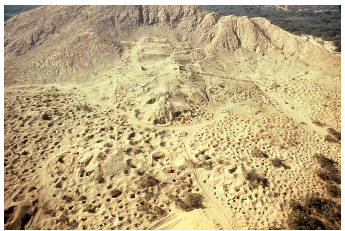
1. Cerro Sapame looting - aerial view of the devastating effects of grave looting at an extensive cemetery on the slopes of Cerro Sapame (ca. A.D. 900-1532) in the Lambayeque region of the north coast of Peru. There are ca. 1000 looters' pits visible here.