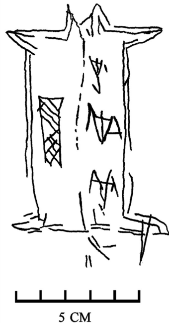
Figure 6. Tracing of the women's style "Box and Border" robe.

A number of key motifs make Atherton Canyon somewhat different than Bear Gulch. There are two guns (Figure 5) and three horses depicted at Atherton Canyon while Bear Gulch has no guns or horses. Also unique to Atherton Canyon are a number of Pecked Abstract tradition geometric designs and one vertical series painted panel. One very unique petroglyph was a women's style "Box and Border" robe (Figure 6).