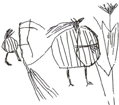
Figure 3. Tracings of shield-bearing warriors from Atherton Canyon.

Atherton Canyon rock art has many similarities to Bear Gulch. Bear Gulch has the largest number of shield-bearing warriors (SBW) at any single site in the Northern Plains, at over 800. Atherton Canyon has the second-largest number of SBW, nearly 200. The shields in question cover nearly 2/3 of the full body height (Figure 3). This large shield was used before the horse was introduced into the Northern Plains.