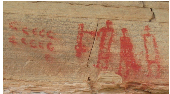
Figure 5. Red painted images of three people (one holding a gun) and horse tracks.

motifs similar to those at Bear Gulch. Finally, Atherton Canyon has "small figure" style images (very small scratched scenes) similar to those identified at Bear Gulch (Figure 4).