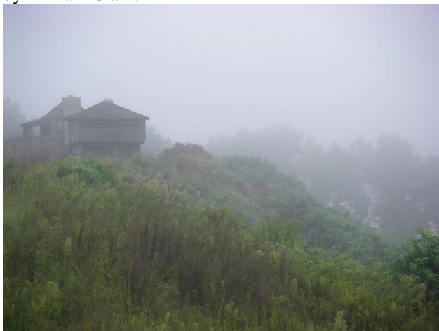
Fort Osage in the fog.

The first Lower Missouri River Archaeology and History Conference was sponsored by the Fort Osage Historic Site in eastern Jackson County. The theme of this conference was the cultural and historical resources of the lower Missouri River valley, focusing on early human settlement, American frontier expansion, and historic development of this region. This conference was also part of the 200th anniversary celebration of Fort Osage's founding in 1808 by William Clark.