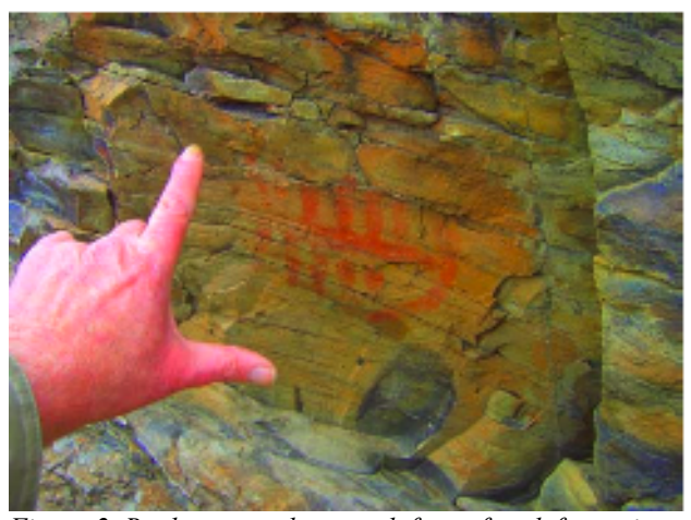
Figure 2. Rock art panel on north face of rock formation.

Careful examination of the rest of the stone feature did not reveal further paintings. I took about a hundred shots of the face that contained the pictographs. I could hardly wait to download the pictures onto my computer (I shoot digital these days, of course) and enhance them with the free Google© program, Picasa©, to bring out details I was unable to see at the site. I was not disappointed by the results I have come to expect from this simple-to-use free application. One adjusts the light level, enhances the sharpness and then increases the color saturation. This tends to magnify very faded pictographs so they are again discernible.