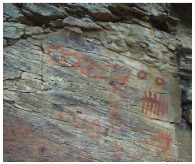
Figure 3. "Snake" image.

First, the bright images near the top deserve attention. They may or not be relevant to the observations later in this article. To the right of the panel, separated from the rest of the panel of a large fissure in the boulder is a "snake image" (Figure 3). The "snake" has nine curves in it and a circle at the lower end. A look at a map of the John Day River will reveal that it has an extremely serpentine course with many sharp curves that nearly loop back on themselves. A leap of intuition suggests that rather than a "snake" being represented that it is more logical this might represent a map of the river course.